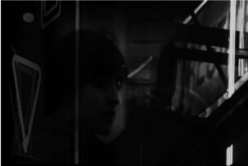
Figure 5 Fragment of vidéo TRAnsCript , by Stanislava Avouska, Agathe Destelle, Anabelle Feuervier, student work from Irena Latek video workshop ENSA Grenoble, 2007