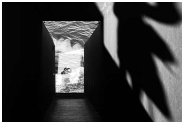
Figures 8 and 9

Fragment of video Passages, Irena Latek, medialabAU, Laboratoire MHA, 2006