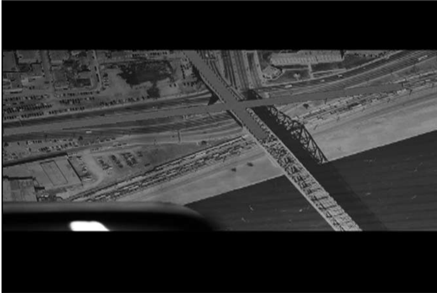
Figure 4 Fragment of work J'arrive à la ville , Martin Bourgault, Irena Latek, part 2 of Ubiquités publiques Desyncronized Public Spaces , medialabAU 2005