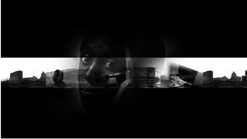
Figure 11 Fragment of work Panorama, interactive document, part 5 of Ubiquités publiques Desyncronized Public Spaces, medialabAU 2005