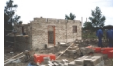
Building a starter house in West Bank

At the end of this four-month first stage of the overall project, we had built only three of the six starter houses that were previously planned. From the first on-site interventions it was evident that the local population were beginning to accept that the Compressed Earth Block (CEB) was a superior building material to concrete. People experienced a greater level of physical comfort in the houses built with earth blocks, which do not become uncomfortably hot in the midday sun, as do the concrete block houses. Because of the high quality of the block-laying work, and, as a result, the fact that the CEB (Compressed Earth Block) masonry walls don't need plastering, people tend to compare the CEB houses to fired brick houses. These houses are more prestigious, with a higher standard of workmanship. In addition, the material itself is a symbol of permanence that can be traced back to the Boer pioneers' settling patterns (Hilton, 98: 226).