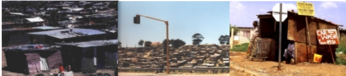
Duncan Village, East London – South Africa