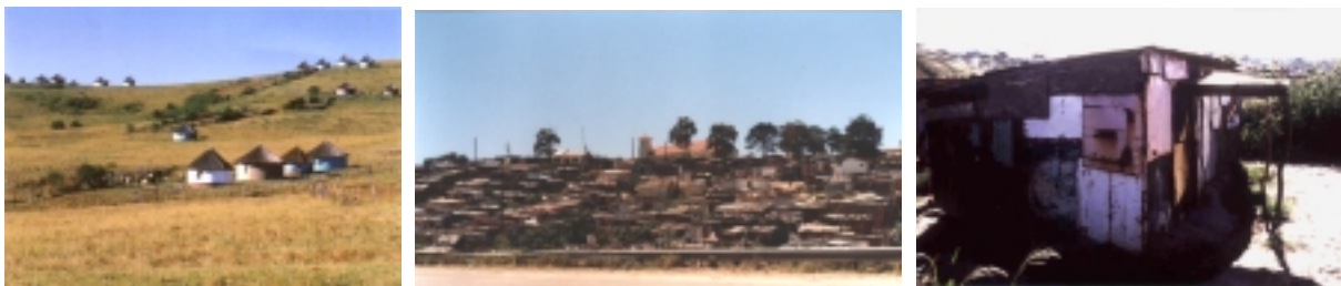
From the countryside to town, the landscape, the density, the materials and technologies change drastically the dwellers' lives

The goal behind this project was to offer a training and housing programme involving the CEB technology that would not only help to reduce the dependency on foreign materials and technologies, but also to demonstrate a viable alternative model for Low Cost Housing programs. The ideal would be houses of better spatial, material and craftsmanship quality than those normally found on the market. They would be offered at a competitive cost and would create more jobs for skilled labourers within the communities. Use of local materials containing fewer pollutants and/or lower embodied energy than ordinarily used, reduce the negative impact of the housing industry on the environment. In this project, we used the local material, the Sabunga earth which is an inert material, directly found underneath the topsoil. The topsoil being useless for building was put aside for the extraction and then put back in its place where it could find its former agricultural use. The Sabunga soil could be manually extracted. Beside being manually passed through a sieve to clear the bigger pebbles and stones, the soil does not require any more transformation to become the main component of the Compressed Earth Blocks.