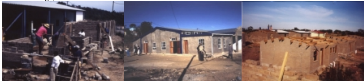
Masonry training at the C.C. Lloyd Community Centre ; Haven Hills South Housing Project, East London – Republic of South Africa