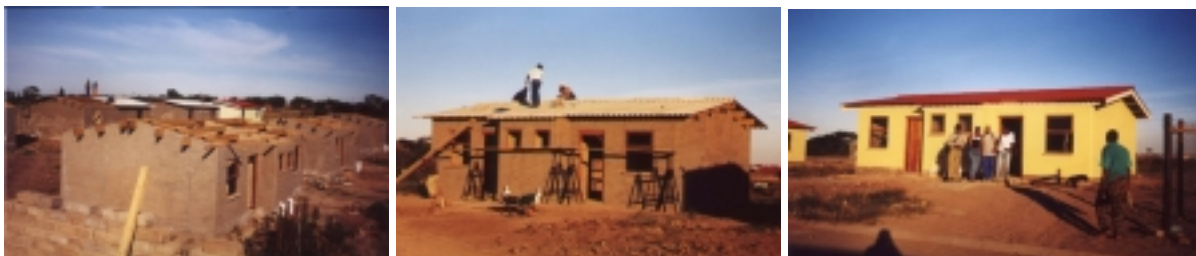
In June 2001, there were 150 houses built by the trained masons.

As a consequence of the positive results of our incremental approach, the project followed subsequent phases of implementation. A new, semidetached house prototype was built in May 1999 and was then evaluated and re-adapted. A few houses later, the project, by now divided into two components—Compressed Earth Block production and the House Building—has now attained a capacity of more than 150 houses a year and is expected to eventually attain its full capacity of 450 houses per year.