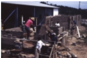
Masonry training at the C.C. Lloyd Community Centre

As part of our strategy to involve as much as possible local partners in our projects, the trainees went to the East Cape Training Centre , based in East London to receive the basics of masonry construction. A few weeks later, the trainees came back to the C.C. Lloyd Township for their on-site training, erecting their first permanent masonry walls, closing the existing open steel structure of the C.C. Lloyd Community Centre . Beside accommodating the thirty trainees at the same time, this was an opportunity to consolidate the infrastructures belonging to the community. After the completion of the community centre, the 30 trainees were ready to split into smaller groups to build demonstration starter houses in the five remaining townships.