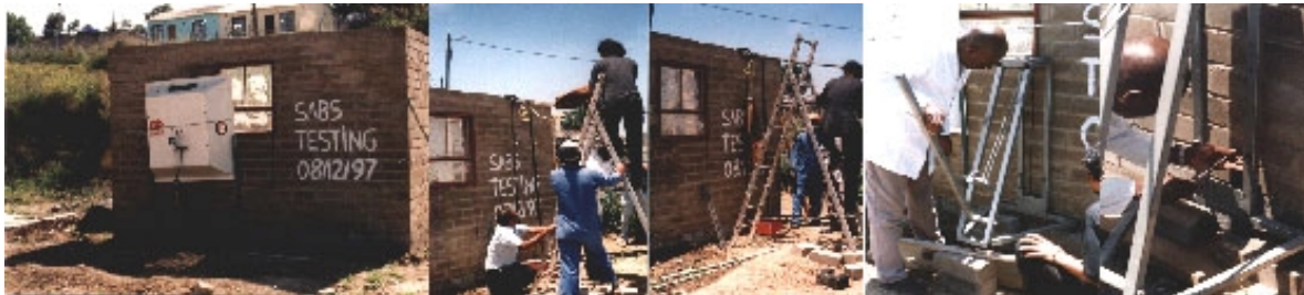
Tests performed by the South African Bureau of Standards (SABS) to obtain the Compressed Earth Blocks (CEB) approval for all the regions of the country.

In order to guarantee the permanence of the project, we brought the Compressed Earth Blocks through a series of tests, necessary steps to have the new material approved by the South African Government. This would mean that houses built with the Compressed Earth Block would be eligible for the Government Housing Subsidy scheme, opening the market to the new local industry. After building a demonstration Compressed Earth Blocks wall, the latter underwent and successfully passed a series of tests performed under the supervision of the South African Bureau of Standards (SABS) in the C.C. Lloyd Township in East London in December 1997. This was a significant step in gaining approval for CEB housing all over South Africa.