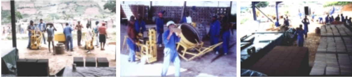
The Compressed Earth Block is associated with the idea of a new and industrialised product.

The first intervention took place between September and December 1997 in six different townships of East London and its periphery, that is to say C.C. Lloyd, Cambridge, Duncan Village, Scenery Park, West Bank and finally, Mdantsane , a homeland township outside East London that was created in the early 1970s, being the second major township of South Africa, after Soweto. From these six townships 30 unskilled men were selected to participate in the CEB (Compressed Earth Blocks)-making and masonry training programme. The location of the C.C. Lloyd Community Centre Township became our headquarters and first training site. They provided us with a roof under which we could teach the making of CEB (Compressed Earth Blocks), and accumulate CEB for the masonry training. Sharing the space of the C.C. Lloyd Community Centre with one of our local partners, Buffalo Flats Community Development Trust, a very active NGO in the communities, grounded us very much in the reality of the townships everyday life and needs.