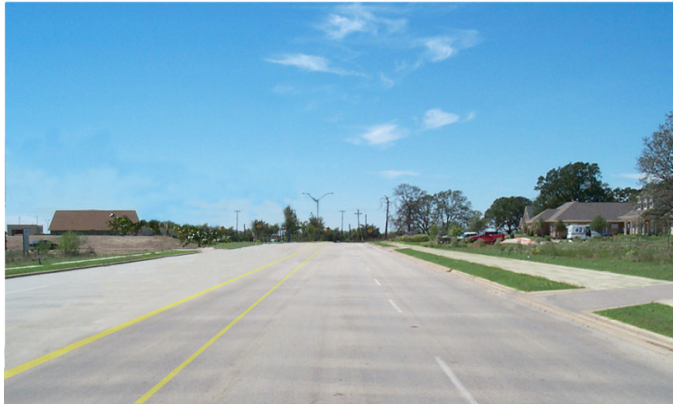
Figure 3. Pre landscape treatment condition for Road X. ©

All user groups will be tested. Car drivers will be tested using curbside and median treatment to identify which features provide maximum safety