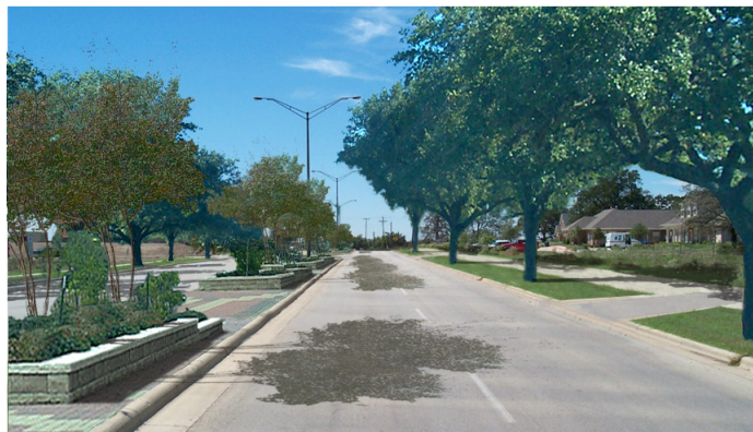
Figure 5. Same road as depicted in figure 4 but standard includes typical planter box installation on central median ©

benefit. Boulevard users will be tested using curbside treatment only. Number of people will be distributed amongst commuter pedestrian, recreational, exerciser and wheelchair. In the following example, the control variable will be constant congestion level in all cells. We are testing how do various landscape treatments modify perception of accessibility and safety. The tentative study cells for the experiment at this point shown in Table 1.