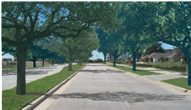
Figure 4. Post landscape treatment condition for typical suburban road shown in Figure 3. ©