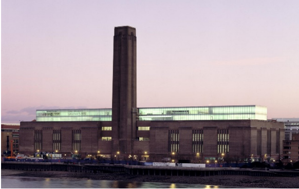
Figure 1 Tate Modern.

Bankside, one of the oldest settled areas in London, offers an urban palimpsest with traces of its gritty history including brothels, the Globe Theatre (a replica of which was built in the 1990s), and a variety of industries including warehouses and docks. Bankside featured a power generating station since the late nineteenth century which was replaced in 1947 with a design by Sir Giles Gilbert Scott, the well-known architect of the Liverpool Cathedral and the Battersea Power Station. This monumental and impressive structure was in active service from 1953-1981 at which point it lay mostly unused for decades. Transformed into the Tate Modern by the Swiss architecture firm Herzog and de Meuron, the museum opened to great acclaim (Fig.1). The thoughtful adaptive reuse approach provides a memorable frame for the viewing of the modern collection. With its tall chimney and industrial skin, the Tate Modern provided a functionalist vernacular architecture; the perfect iconography for a growing museum brand.