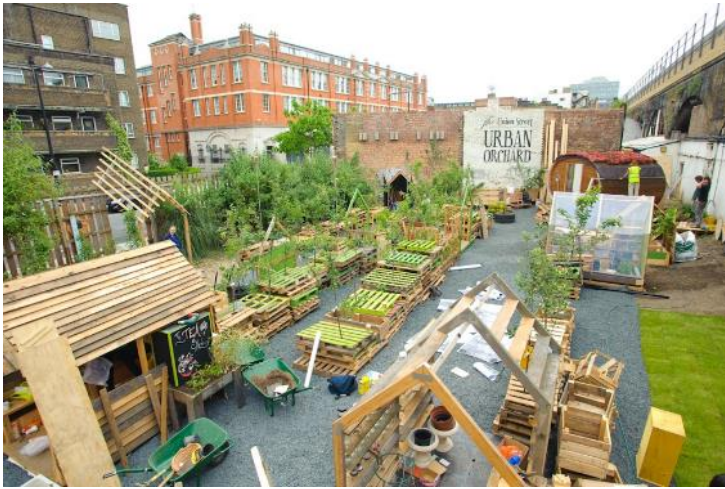
Figure 5 Bankside Urban Orchard.

Commissioned by The Architecture Foundation and built by the Bankside Open Space Trust and hundreds of volunteers, the Bankside Urban Orchard was a temporary installation part of the London Festival of Architecture in 2010. Designed by the American landscape architect Heather Ring of the Wayward Plant Registry, the project transformed a derelict site into a public garden with planters, raised garden beds, and a