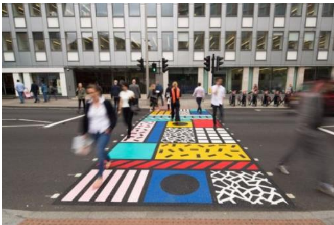
Figure 4 Colourful Crossing.

One of the first Colourful Crossings was a temporary, interactive art installation, "Performer," by the New York artist Adam Frank. Visitors to Bankside received a spontaneous round of applause as they pass under the railway bridge at the junction of Redcross Way. The more movement, the louder the applause, encouraging people to dance and interact further with the installation. If the viewer is still, the virtual audience calms and eventually goes silent except for an occasional cough. When the viewer leaves the illuminated area the viewer hears applause proportional to the total amount of movement in that session.