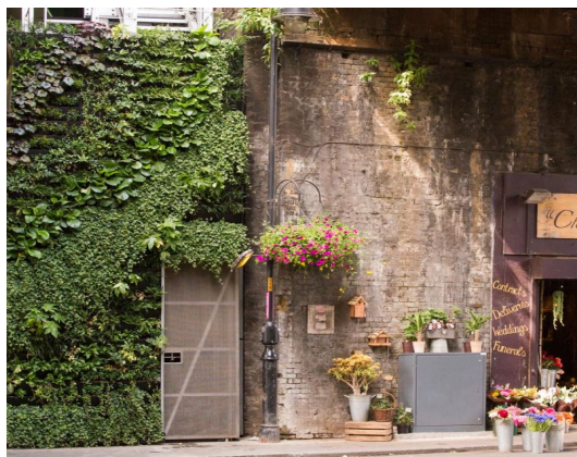
Figure 6 Verdant Viaduct.

Reclaiming and animating disused corners of Bankside is a key component of Bankside Urban Forest's strategy to enhance the area. A recent green infrastructure audit of green spaces and assets in the Bankside neighborhood which was carried out by Better Bankside and the Ecology Consultancy highlighted a range of opportunities for increasing green cover in the area in line with Mayoral targets. The Mayor of London is working to increase green cover in London by 5% by 2025. In Bankside they are working to exceed these targets through initiatives like Bankside Urban Forest and the Bankside Neighbourhood Plan. In 2017, Bankside applied for and was awarded funds from the Mayor of London to focus on a “Clean Air Mini Neighbourhood” (Giordana).