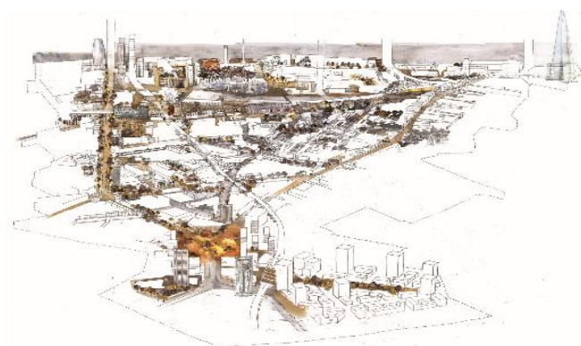
Figure 2 Bankside Urban Forest.