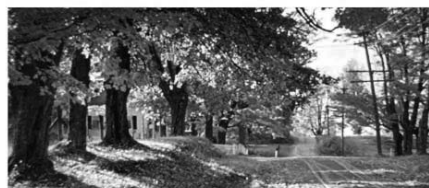
All That Heaven Allows, 1955