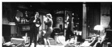
The Apartment 1960