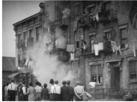
One Third of the Nation, 1939

The common characteristics of both American and British films, is that the metropolis together with poverty, seem to be the reason why young people become engage in criminality. All these films present on the one hand, the criminalization of the metropolis, and on the other, the pastoral power as a way to salve individuals and transform them into good citizens. In Boys Town , a dedicated priest builds a community for city kids in the middle of the countryside. The rural life, the gardens, the nature and the discipline are the key elements to rehabilitate hundred of trouble kids.