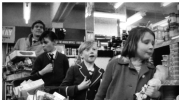
The Lonliness of the Long Distance Runner, 1962

In The Loneliness of the Long Distance Runner , the city is linked with criminality, materialism, and consumerism, while nature is systematically associated with liberation and love. In this film nature functions as a trigger of conscience, as the instance of reflection and deep though. While Colin runs through the open fields analyzing his criminal past and taking decisions for the future, the only moments of happiness that Colin remembers are portrayed by natural landscapes.