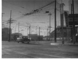
The Asphalt Jungle, 1950