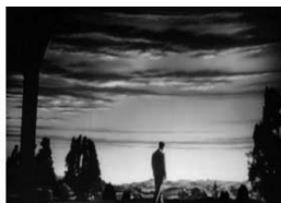
kings Row, 1942