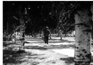
Boys Town, 1938

In The Loneliness of the Long Distance Runner , the city is linked with criminality, materialism, and consumerism, while nature is systematically associated with liberation and love. In this film nature functions as a trigger of conscience, as the instance of reflection and deep though. While Colin runs through the open fields analyzing his criminal past and taking decisions for the future, the only moments of happiness that Colin remembers are portrayed by natural landscapes.