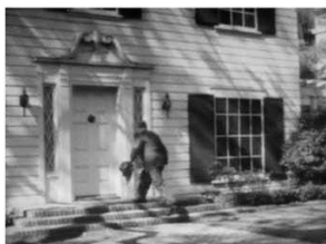
Father's Little Dividend, 1951