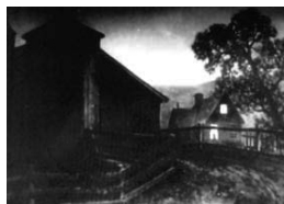
Our Town, 1940

The image of a small town surrounded by rural land, where boundaries between urban space and countryside are blended in a harmonious communion, is the image used by American and British family dramas in the 1940s. American films, such as It’s a Wonderful Life , Magic Town , Our Town and many others, illustrate how the commercial industry of cinema reiterate the connection between honesty, decency, and especially family, with low-dense neighborhoods, single-family homes, traditional architectonic styles, walkable spaces, Main Street, the church, the school, and the drugstore. All these spaces provide a safe environment to cultivate enduring relationships. In American films, family-centered values are also represented through the emphasis on specific styles of domestic architecture.