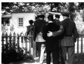
Hail the Conquering Hero, 1944