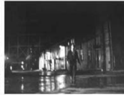
Naked Streets, 1955

The American urban dramas about troubled kids of the 1930s are a distinctive genre that portrays the urban poverty of slums located in inner zones of the city, especially after the Great Depression. Examples, such as Wild Boys of the Road , Boy of the Streets , Angels with Dirty Faces , and Boys Town present the city streets as schools of delinquency, in where vulnerable kids have no choice but to become future criminals. In these films families are dysfunctional, parents seem to be absent, so kids are always in the streets, learning from negative role models and cultivating dangerous associations. Interior domestic spaces are practically invisible, and street spaces are dense, dirty and dangerous. Kids are always in troubles, they are fighting and policemen watching and controlling the street form part of the townscape, creating a sort of unsafe atmosphere in any corner of the street.