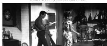
Sex and the Single Girl, 1964

In The Lost Weekend , an alcoholic writer experiences his worst crisis in the claustrophobic space of a New York apartment. The apartment is also the refuge of excluded people; besides the poor, apartments are homes for minorities, immigrants, and anyone who do not fit entirely into the productive society, such as artists, divorced, and playboys. In Two for the Seesaw , a divorced man and a little known artist, share their sorrows in decadent apartments that evidence deteriorated walls, and provisory decoration. From Dark Victory to Come Blow your Horn , when frivolous characters that refuse any commitment decide to put their life on order and get married, they always leave their apartments and the mundane city life to start a family in the countryside or the suburbs. From comedies to crime films, apartments seem to be useful as transitory solutions, but never as proper places to raise a family. Films, such as Mr. Blandings Builds his Dream House and Don't Eat the Daisies are examples of families with children that live in apartments but their main objective is move to the countryside.