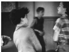
Angels with Dirty Faces, 1938