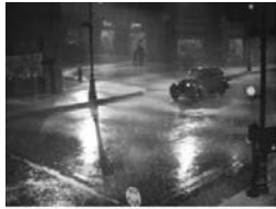
Scarlet Street, 1945