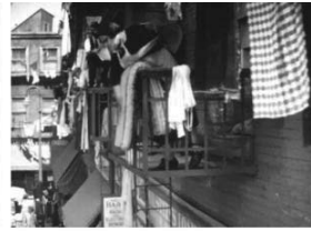
Angels with Dirty Faces, 1938