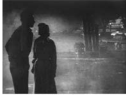
Dark City, 1950