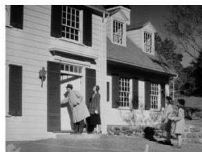
Mr. Blandings Builds his Dream House, 1948