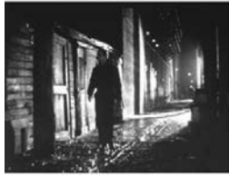
On the Waterfront, 1954