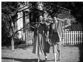
All that Heaven Allows, 1955