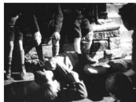
Odd Man Out, 1947