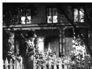
It's a Wonderful Life, 1946