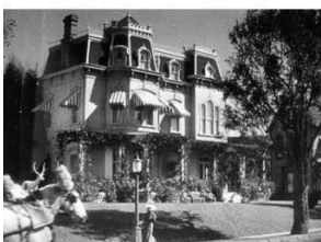
Meet Me in St. Louis, 1944