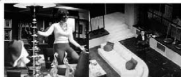
Come Blow your Horn, 1963