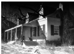
Dark Victory, 1939

In Hollywood films, the rooms of single-family houses are cozy rather than luxurious spaces. Cedric Gibbons headed the Metro-Goldwyn-Mayer's art department and gained unparalleled recognition as one of the most influential designers during the Golden Age (Wilson 2000, 101). Gibbons was particularly renowned for introducing modern design to Hollywood films, however his use of the term 'modern' does not mean the Modern Movement, but a style inspired on the Art Deco. The domestic interiors created by Gibbons became models that female moviegoers could attempt to reproduce in their own homes (ibid, 110). The country house of the film The Women was described in 1942 by the magazine House Beautiful as "Hollywood Provincial," and recommended because it "makes such a friendly home" and represented the "American ideal of good living" (ibid, 111). As Wilson notes, Hollywood films have both reflected and shaped American views about modern domestic design, and most of Americans did not want to "start from zero," at least not in terms of architecture (ibid, 159-60).