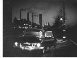
Where the Sidewalk Ends, 1950