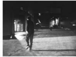
Panic in the Street, 1950