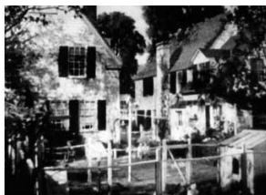
Our Town, 1940