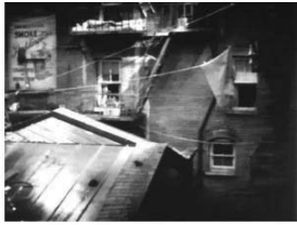
Dead End, 1937