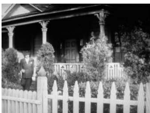
The Magic Town, 1947