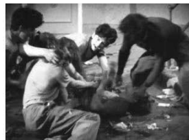
Dead End, 1937