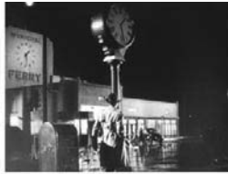
The Street with No Name, 1948