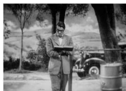
The Magic Town, 1947