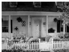
The Bachelor and the Bobby Soxer, 1947