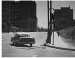
Down Three Dark Streets, 1954