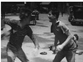
Boys Town, 1938