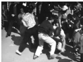
Boy of the Streets, 1937