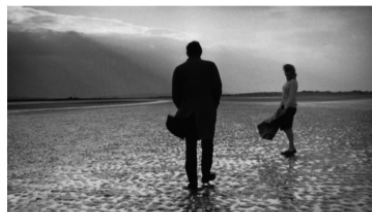
The Lonliness of the Long Distance Runner, 1962