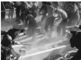
Wild Boys of the Road, 1933

British films also portray troubled youth. In the second-half of the 1940s, the film Odd Man Out is about a gang who belongs to the IRA and become idols and models for the kids of the streets. British films, such as Violent Playground and The Loneliness of the Long Distance Runner represent an excluded working-class youth, who grew up in the industrial city and their dissatisfaction with the urban environment is translated into a rebellious and defiant attitude, which leads them to commit criminal acts.