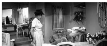
Pillow Talk, 1959

The apartment, as the most distinctive housing model of inner zones of big cities, is never associated with positive or happy characters. Especially in American films, with the exception of luxury apartments inhabited by billionaires, apartments are spaces that serve to portray stories of poverty, crime, violence, adultery, and drug abuse. Examples such as Scarlet Street , The Apartment , and Any Wednesday , tell stories about extramarital encounters and easy women that occur in metropolitan apartments.