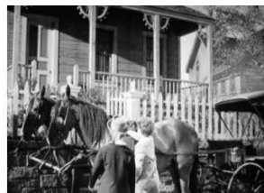
Kings Row, 1942