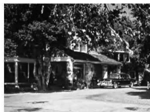
Imitation of Life, 1959

In the post-war Britain, and particularly in London, there was a simultaneous desire for radical changes, and at the same time, the aspiration of tangible continuity (Shonfield 2000, 4). The functionalist principles of the Modern Movement established the rules for the new buildings developed between the the 1930s-40s, with extensive examples of social housing. While the Modern Movement aspired to achieve a real social change and a complete transformation of the urban space, the response to the anxieties of people after their cities were heavily destroyed was mirrored with a need to recover old cultural traditions. In terms of architecture,