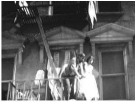
Boy of the Streets, 1937