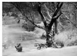
It's a Wonderful Life, 1946