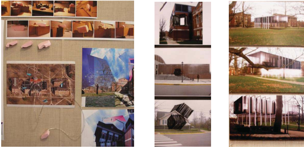
Figure 11-13. Undergraduate Design Studio –the 13 th Floor

The design studio considered the 13 th floor (a floor unmarked in high-rise buildings) as an addition to an existing campus building. Using films researched, readings, and reflective essays, making films and physical projects, student interpretations included a parasitic component to the existing historic building. Figures 11 - 13 presents three projects: the 13 th floor as a parasite resting, consuming, puncturing the building, or able to break off and find another host. Figure 13 presents light emitted in the landscape giving the illusion of a floating construct. However, when approached at different times of the day the structure is visible breaking the continuity of an academic quad.