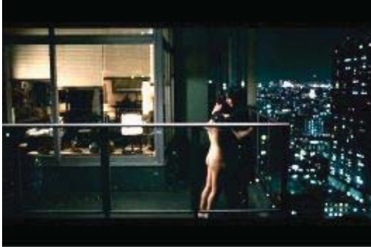
Figure 5: Babel , Alejandro González Iñárritu.

on the screen addresses society's power politics. Through camera angle and placement on the screen, the subject places, us, the viewer, directly in that power discourse. When a subject is filmed depicting a vulnerable condition, we are often voyeurs upon the screen scene. As viewers we consider our relationship in space vis-à-vis the placement of the subjects on the screen.