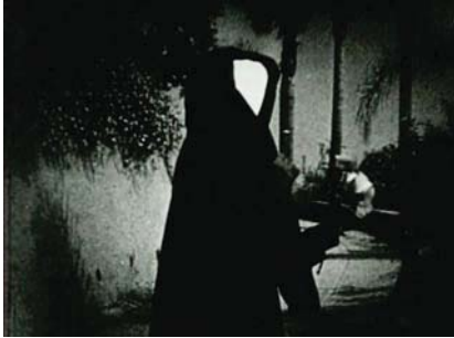
Figure 7. Film still, Meshes of the Afternoon , Maya Deren.

Meshes of the Afternoon , 1949-1959, is early independent filmmaker Maya Deren's surrealist self-reflective visual and aural (sound without text) experimental film. Deren challenges the viewer with highly personal symbolic imagery referencing Freudian psychoanalysis. Deren represents herself in the film- she is the main protagonist. The mysterious mirror faced character (Fig. 7) dressed in black carrying a white flower appears at intervals throughout the film. One could interpret the figure as Deren's nemeses, spiritual power, or her soul leading her, even taunting her as she struggles for self-identity.