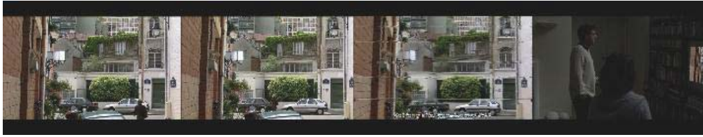
Figure 14. Caché , Michael Haneke, Source: (Sony Pictures, 2006)