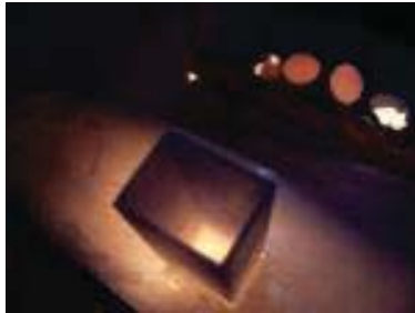
Figure 10. Objectivity/subjectivity: Materiality and light

Student work (Fig. 9) compresses the ability of the self to see beyond the frame. Figure 10, is a thesis design of an art gallery. Light quality and materiality establishes the sequential rhythm through gallery spaces.