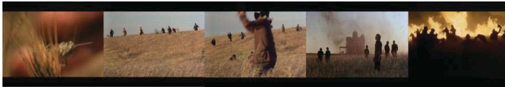
Figure 2: Days of Heaven , Terrence Malick.

Malick's handling of the landscape functions at multiple scales: the materiality of the landscape, and the landscape as metaphor for the protagonist's perceptions and actions. As the narrative plot continues, the farmer discovers the ruse of Bill, Abby and Linda. As locusts consume the farmer's wheat crop (Fig. 2.), the farmer starts a fire to stop the locust plague that will, of course, destroy his land. The last shots of the fire sequence present a band of orange yellow fire at the horizon line. The Horizon Line holds the promise of freedom but is imbued with each character's ambition destroying land and lives. Purposeful framing and camera movement may be fairly obvious, but the number of subjects or objects that move back and forth across the frame and against the direction in which the camera is tracking heightens our sensitivity to the multiple layers of the narrative plot that includes the landscape as a prime character.