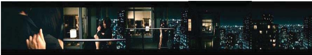
Figure 6. Final tracking and zoom in Babel , Alejandro González Iñárritu.

Modernity has created familiar territory for viewers of this 21 st century Tokyo: steel and glass structures with streamlined articulate interiors of wood, plastic, and metal furniture, each room lit floats in the Tokyo night. At this moment, the young woman and her father are the only figures on a Tokyo balcony spatially extending the apartment interior connecting to every other Tokyo balcony enveloped in the night. The daughter and father's circumstances connects the human story to the architecture that contains their life, mirrors it, and allows us to consider what future consequences may evolve beyond the frame of the screen. Our conjecture beyond the narrative we are witnessing, within our own imagination, is the scene's power.