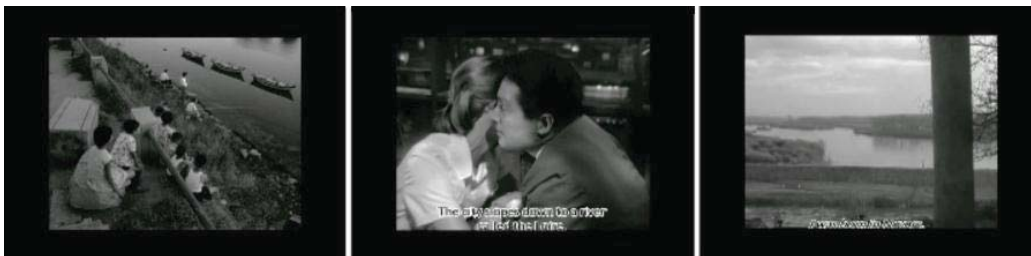
Figure 3: Hiroshima Mon Amour , Alain Resnais. Stills from a sequence. Left frame: Hiroshima; Far right frame: Nevers.

Architecture student (Fig. 4) addresses issues of time as well as materiality in his video installation. Two monitors are placed facing each other. Each monitor presents a film of a person speaking. The characters, in separate films /monitors, each speaks a language the other does not understand. The films are viewed through a sheet of ice placed over the monitor. The ice slowly melts through the time of the installation presentation. At first, context and content are the same: the image is blurred, and communication between the two is strained. As the ice melts, images become clearer, and, over time, gestures, tonal nuance become familiar territory for the two characters as they begin to understand each other.