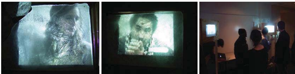
Figure 4: Student Work; left and middle: Video viewed through sheets of ice; Right: Video Installation (2009)

Architecture student (Fig. 4) addresses issues of time as well as materiality in his video installation. Two monitors are placed facing each other. Each monitor presents a film of a person speaking. The characters, in separate films /monitors, each speaks a language the other does not understand. The films are viewed through a sheet of ice placed over the monitor. The ice slowly melts through the time of the installation presentation. At first, context and content are the same: the image is blurred, and communication between the two is strained. As the ice melts, images become clearer, and, over time, gestures, tonal nuance become familiar territory for the two characters as they begin to understand each other.