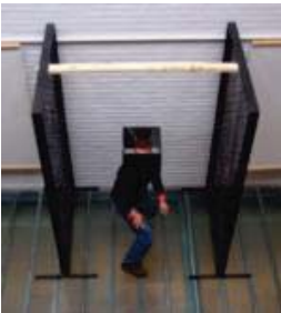
Figure 9. Self-Portrait