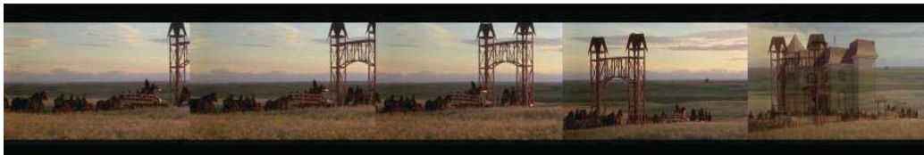
Figure 1: Days of Heaven , Terrence Malick. (The Criterion Collection, Paramount Pictures, 1978)

In the last frame of Figure 1 the farm gateway dissolves as the farmer's mansion appears (an editing transition or cross-dissolve). In the endless landscape of wheat stalks, the farmer's Victorian house sits slightly above the rest of the land, and is usually centered in the frame. Media historian Anne Friedberg in The Mobile and Virtual Gaze in Modernity , referencing Michel Foucault's work, Discipline and Punish: The Birth of the Prison , discusses Jeremy Bentham's 1791 panopticon device, an eight-sided space (often a tower) in which the center sits an overseer, unseen from those jailed. The overseer sees everything—a relationship that establishes power through surveillance. In Days of Heaven , the farmer visually sees everything from his central perch, but he does not perceive the real intention of the two lovers.