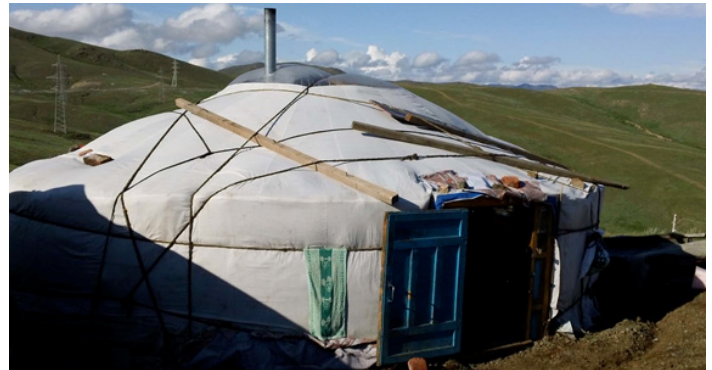
Figure 3: Traditional "ger"

At the top of the structure thick felt acts as an extraordinary insulating material. Finally, an impermeable plastic layer and a traditional white cotton fabric complete the ensemble. A ger can be built in a couple of hours by a group of four people and have been recognized as a very suitable shelter for nomads (Figure 3). The structures are adaptable to the changing climatic conditions of continental countries, where summers can be hot and winters extremely cold. They are portable and structurally strong, resisting the winds of the Steppes. Nomadic life using ger as a shelter can be very sustainable in the rural areas of Mongolia. Because of the small quantity of ger built in a given location, the ecological impact is quite small. Mongolians have a strong tradition of respecting nature. Unfortunately, when ger form high-density districts, the impact can be negative. Urban ger in Mongolia are built without an existing urban plan or the installation of services. As a result, extensive informal communities have appeared in the last few years.