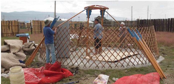
Figure 2: Building a "ger" in Ulaanbaatar

Mongolia is experiencing a cultural transformation as globalization and urbanization are changing the country's traditional nomadic way of life. Major demographic shifts are raising the urbanization rate in cities such as Ulaanbaatar, the capital, which has grown, on average, more than eleven percent a year in the past twenty years.