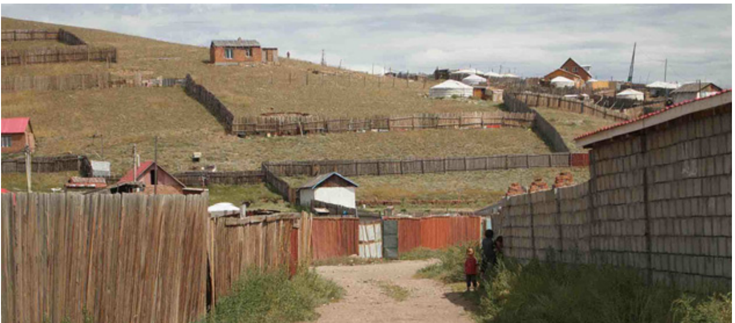
Figure 1: Ger and permanent dwellings in Uliastai, Ulaanbaatar.

Ger districts, informal urban settlements, Mongolian slums, residential satisfaction, quality of self-built shelters.