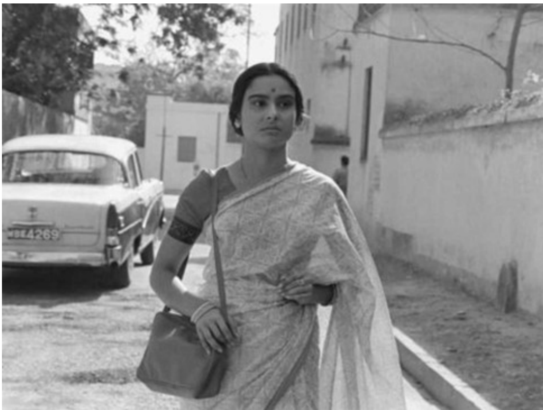
Figure 9: Arati in the big city. https://dailywelle.wordpress.com/2020/08/12/a-second-wave-analysis-of-satyajit-rays-mahanagar/