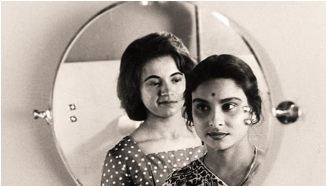
Figure 8: Arati in the film Mahanagar seen wearing lipstick after being assisted by her Anglo-Indian colleague. https://www.firstpost.com/entertainment/indian-films-that-sparked-the-critic-in-me-satyajit-rays-mahanagar-is-the-definitive-feminist-classic-8809641.html