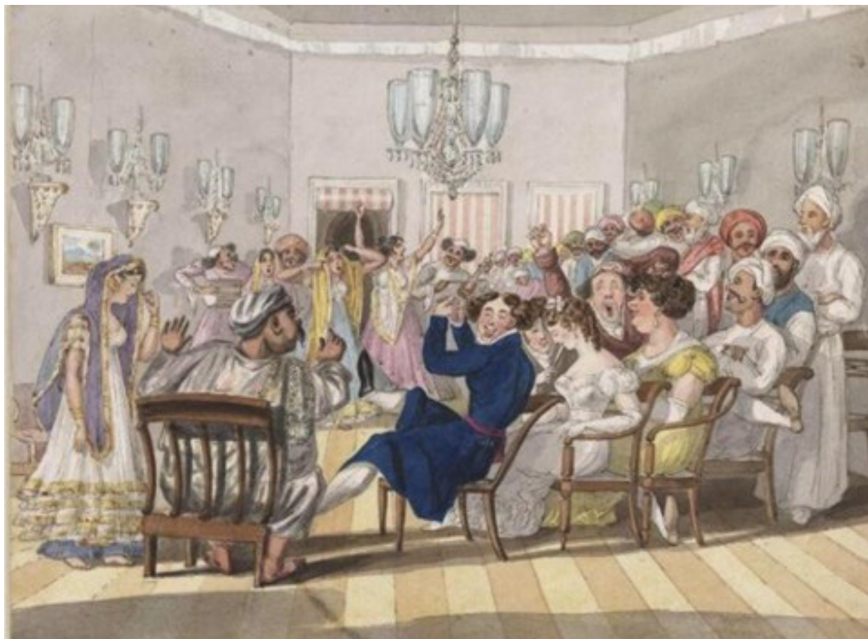
Figure 7: A nautch party with Europeans in Calcutta. Illustration by Sir Charles D'oyly.

urban public spaces was related to the presence of the 'public' women or the sex workers (colloquially called the prostitutes) in the streets of nineteenth century Calcutta. Their transgression of normative gender and sexual boundaries posed a significant threat to family and domesticity and became a cause of concern for the respectable reformers. In the first half of the nineteenth century, widowed women from elite or kulin brahmin families were engaged in this profession. However, in the latter half of the century, recurrent famines, destruction of artisanal trades, and discriminatory wages in agricultural practices, pushed women from lower castes and classes to take to this trade (Banerjee 2009; Chattopadhyay 2006).