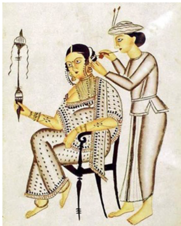
Figure 4: Kalighat pat painting of a courtesan with barber. Kolkata 1875.

(Victoria and Albert Museum 1875). She is wearing an opaque saree with her body fully draped and her head covered partially by the end of her saree . These depictions indicated how respectable women of the household as symbols of chastity had to internalize traits of servitude and show high moral standards. On the other hand, a courtesan's image seated on a chair with a hookah in her hand and a barber pricking her ear (See Figure 4), is a startling contrast to the image of conformity of the bhadramahila in Figure 3. She is wearing a translucent saree and her head is uncovered and bare. Her posture with one leg lifted over the chair depicts her lack of chastity and she also has a smile on her face unlike the bhadramahila who had her head facing downward (Victoria and Albert Museum 1875). The smile on her face and her "voluptuous" form was an expression of her aggressive sexuality and seductive nature (R. Chatterjee 2000). These paintings illuminate the anxiety around the overlapping tensions of gender and class— "about gender ambiguity being articulated in the language of sexual promiscuity— the ambiguity between the respectable women and the prostitute" (Chattopadhyay 2006, 262). Women from respectable families were restricted to the private domains of the household and burdened with different chores like cooking, cleaning, serving, or performing religious rituals. Even their education was confined to