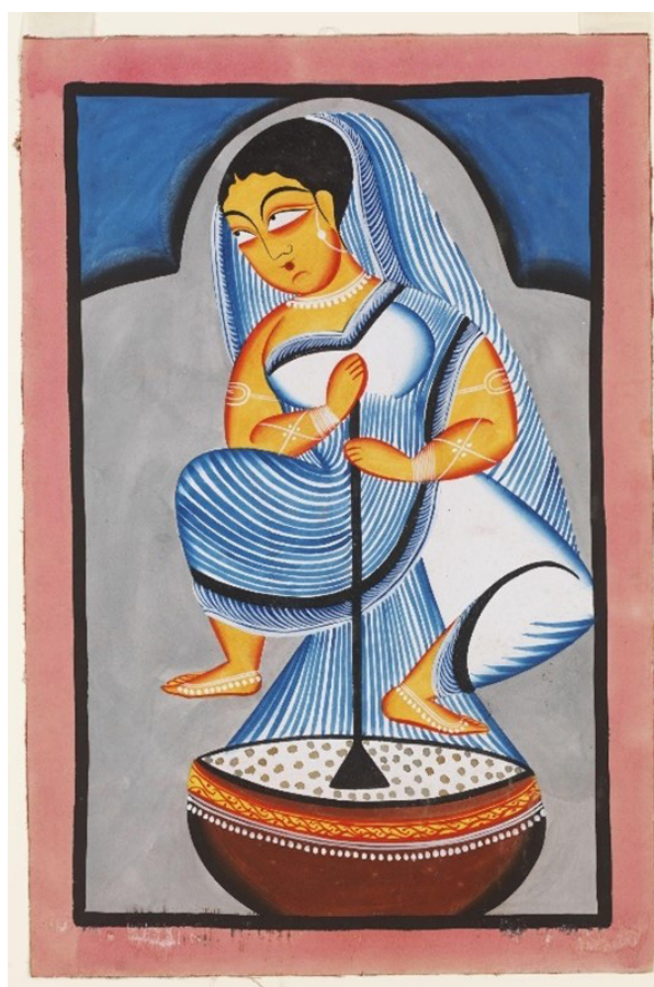
Figure 3: Kalighat pat painting of a woman churning milk. Artist: Uttam Chitrakar. Victoria and Albert Museum, https://collections.vam.ac.uk/item/O1241568/a-woman-churning-milk-kalighat-painting-uttam-chitrakar/

Industrialization replaced the cloth-backed paper scrolls with cheap rectangular sheets of mill paper, making these paintings inexpensive and affordable to the lower class. Thus, it became a popular form of art for the masses and was looked down upon by the Europeans and native elites, who called these bazaar 5 art. These painters were not only depicting stories of gods and goddesses, but they also started responding to the chaos of an emerging modernity in Calcutta. The articulation of femininity and the representation of women in their temporal and spatial location was a common theme in these paintings. In Figure 3, we can see how a virtuous housewife or grihalaxmi (goddess of the hearth) has been represented. She is seen in a domestic setting, specifically in her kitchen, as we can tell from her proximity to utensils and her act of cooking