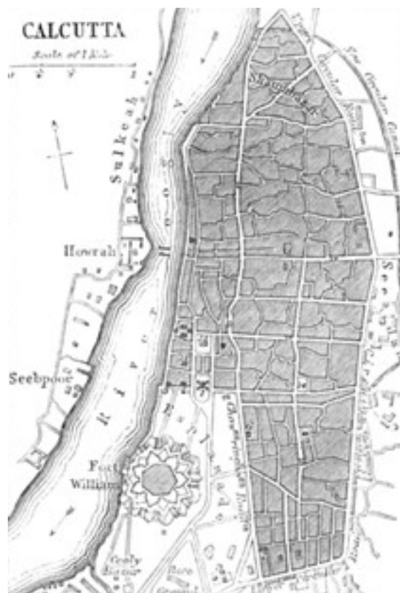
Figure 1: Map of Calcutta (1851) showing "White Town and "Black Town". https://victorianweb.org/history/empire/india/calcutta/1.html .

along the Hooghly River. It was mostly occupied by agrarian and fishing communities. After the revolt of 1757, the East India Company defeated the Nawabs of Bengal, taking control of the region around the three villages and establishing their power by rebuilding their fort in the South around the village of Gobindapur (P. Sinha 1978; Ghosh 2016). Calcutta as an urban center underwent significant changes in its spatial layout after this period. The process of building the fort and developing the region for the colonizers entailed rapid eviction of the indigenous population from those areas. The city was divided along racial lines, with the area around the fort and to the south of it occupied by the British and Europeans and the northern and western part of the city inhabited by the native population. The color coding and naming of these parts of the city as the White Town and Black Town reinforced the imperialistic imaginary and racialized logic. The White Town in its sparsely distributed spatial layout was distinct from the close-knit urban fabric of Black Town (See Figure 1). While the 'modern' White Town was characterized by European style villas, official buildings, wide streets, modern sewers parks, and gaslights, the Black Town, was synonymized with disease, filth and